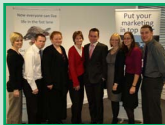
The team at Profile Communication

"We are looking forward to working with companies on Winsford Industrial Estate and extend a warm welcome to anyone who wishes to drop in and meet the team."