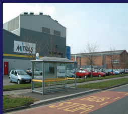
Development work undertaken which will see up to ten further sheltered bus stops across the estate.