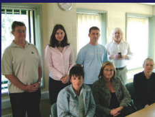
Staff from Winsford Ind Estate on a days training